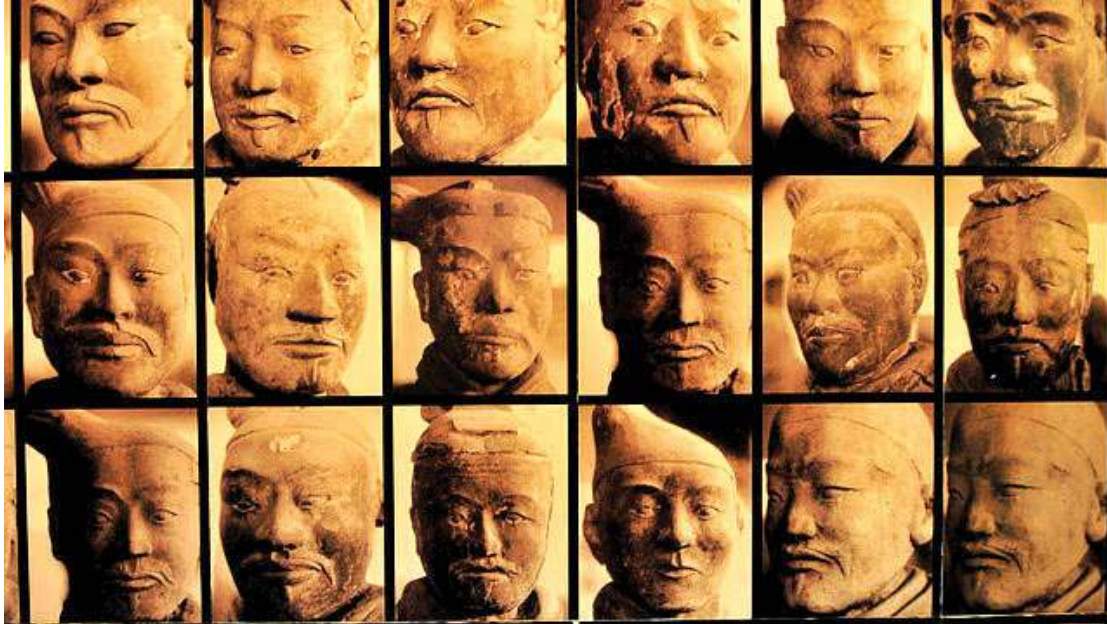
Figure 6: Faces of the terracotta soldiers