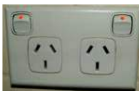
Figure 4: An electrical socket