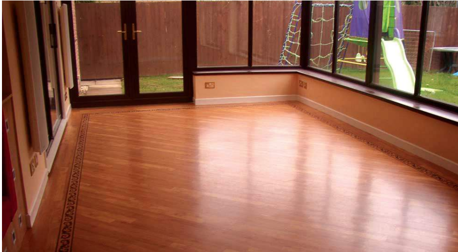
Figure 5: Laminate wood flooring

18. Figure 5 shows laminate wood flooring made of plywood with a hardwood veneer.